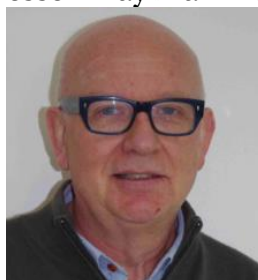
General Co-Chair, icSmartGrid2023