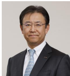
Honorary Chair, icSmartGrid2023

You will find the detail information about this activity on the conference official website. Please visit http://www.icsmartgrid.org/