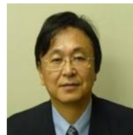
General Co-Chair, icSmartGrid2023