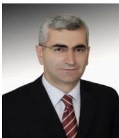
General Co-Chair, icSmartGrid2023