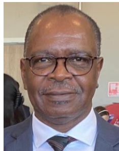
General Chair, icSmartGrid2023

Corporate Senior Executive, Vice President, TMEIC, Japan